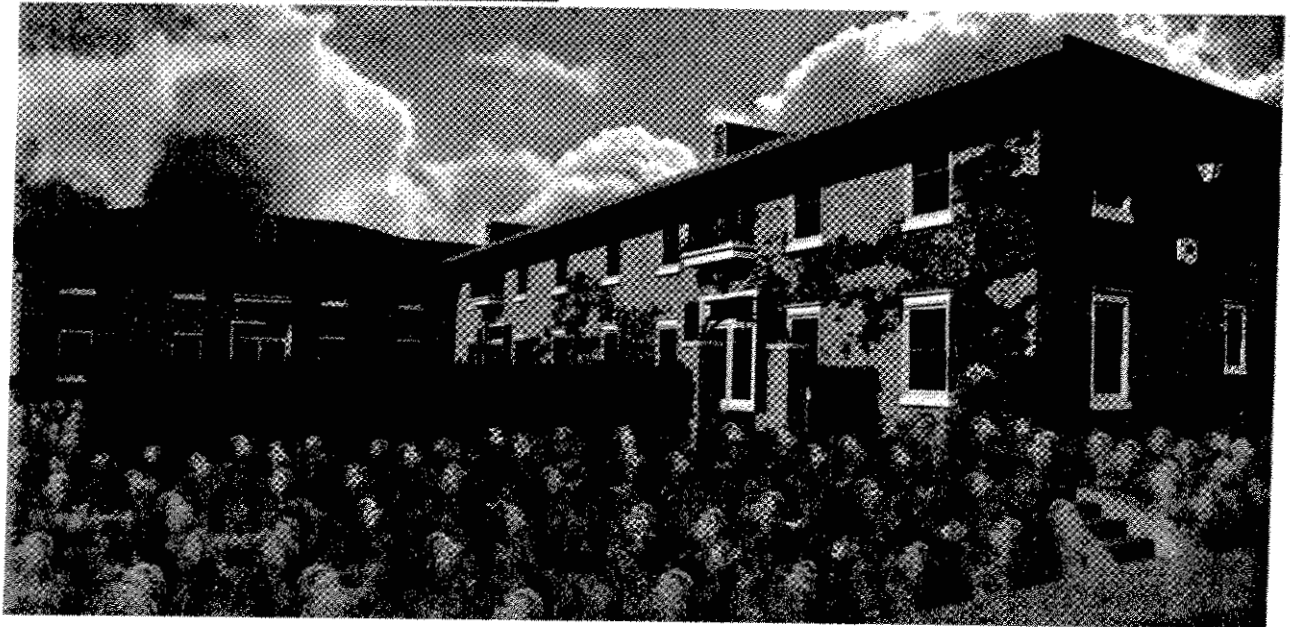
PERSPECTIVE FROM COLORADO BLVD.