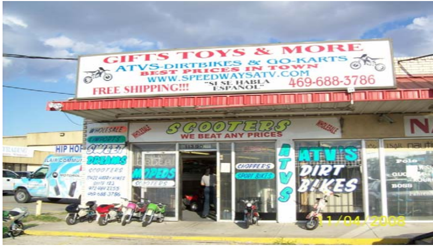
Before photo of sign violations