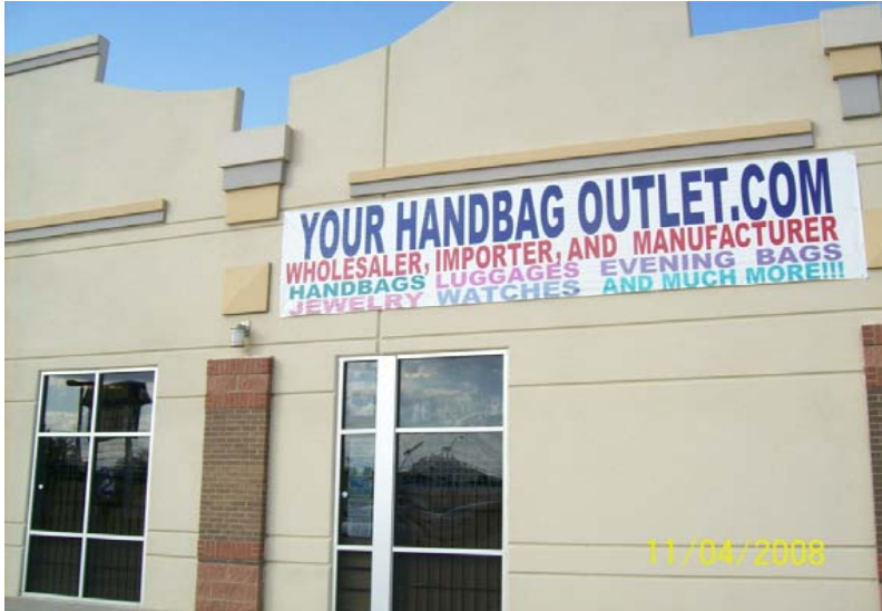
Before photo of sign violation