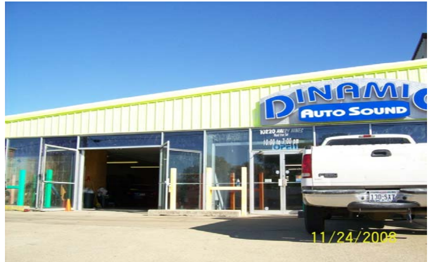
After photo of corrected violations