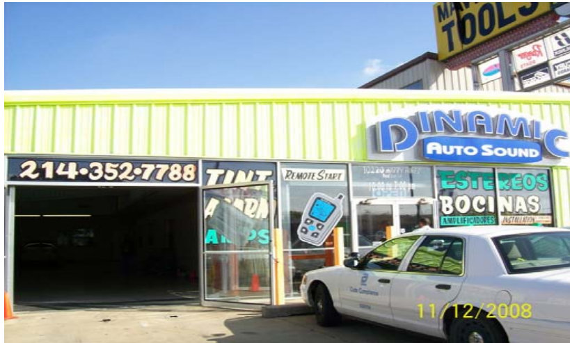
Before photo of sign violations