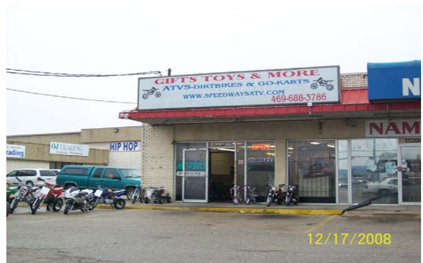
After photo of corrected violations