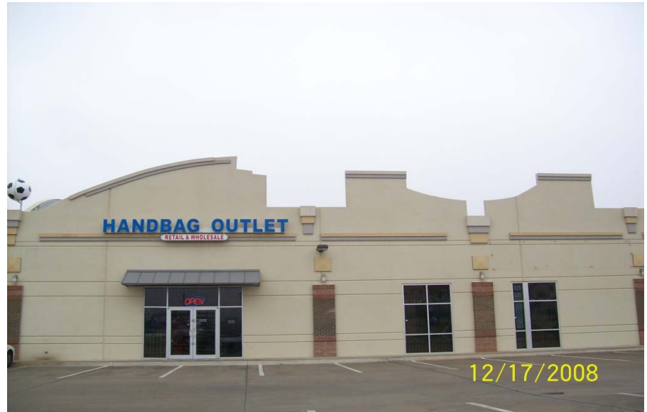
After photo of corrected violation