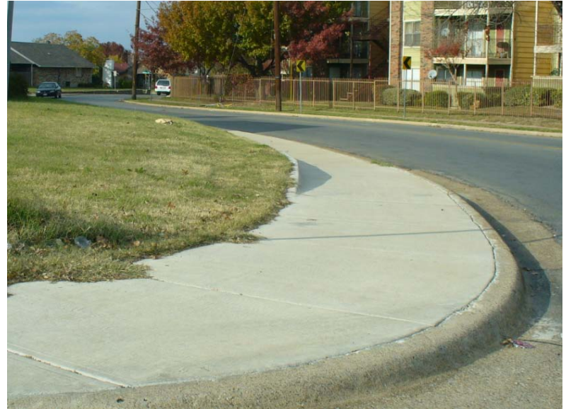
CDBG-R funded sidewalk improvements along Cheyenne Road (left) and Dilido Road (right).