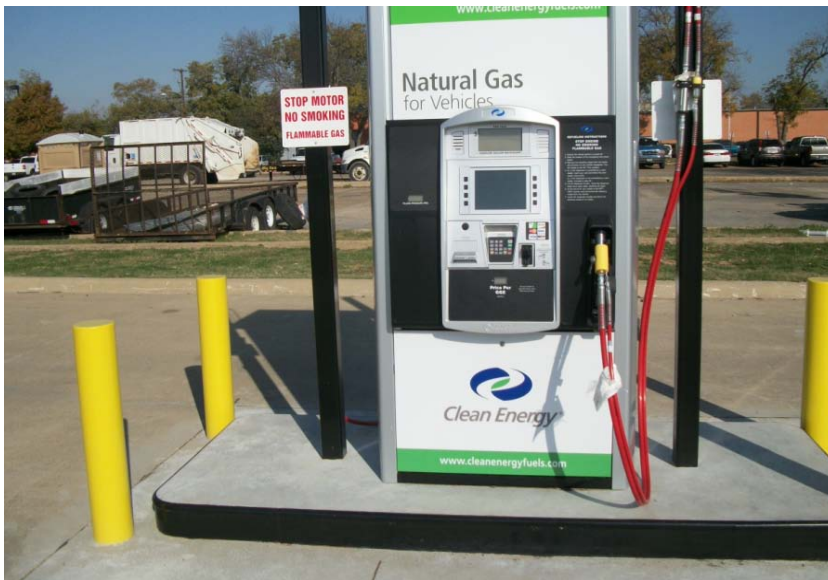
Fast-fill pump at the newly constructed CNG station on Municipal Street.