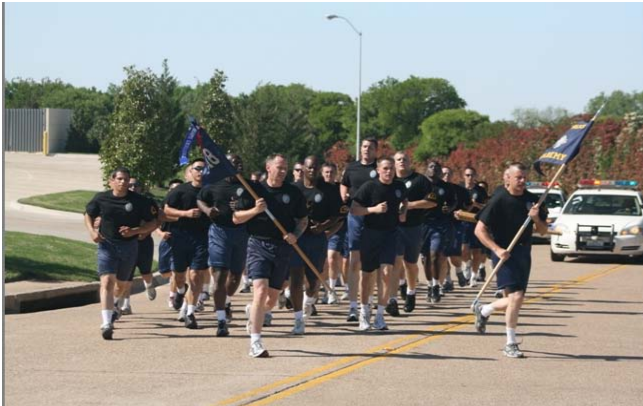
New Officers hired with COPS and/or JAG funds