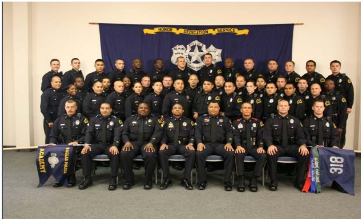
One of the graduating classes of police officers hired with COPS and/or JAG funds.