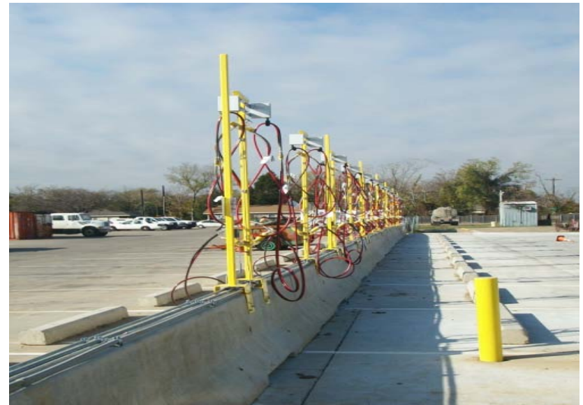
Twenty-six (26) slow fill pumps at the newly constructed CNG station on Municipal Street.