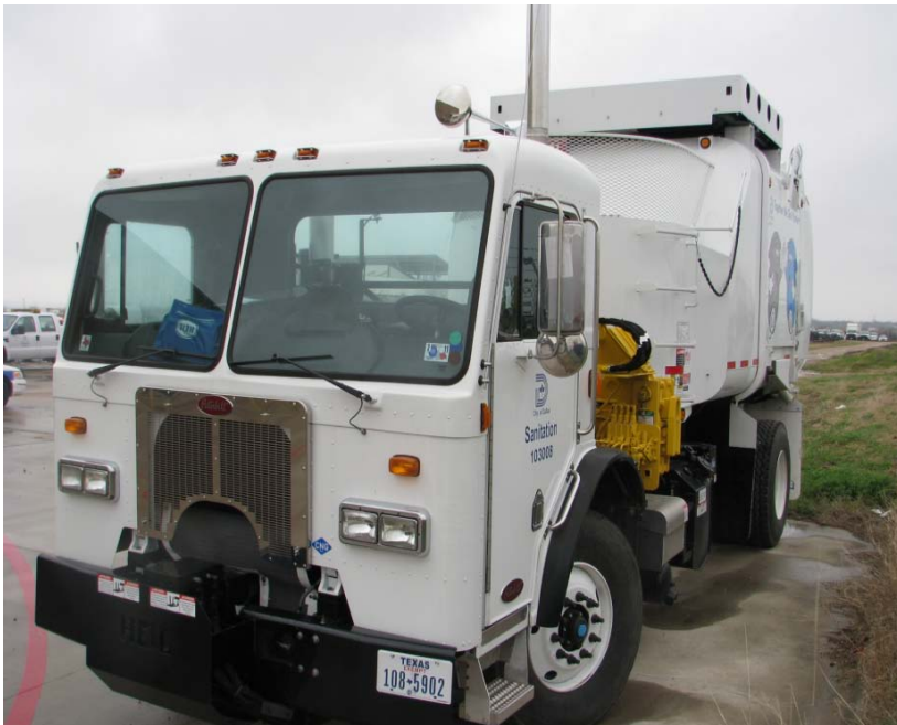
Sanitation vehicle purchased with Clean Cities funding.