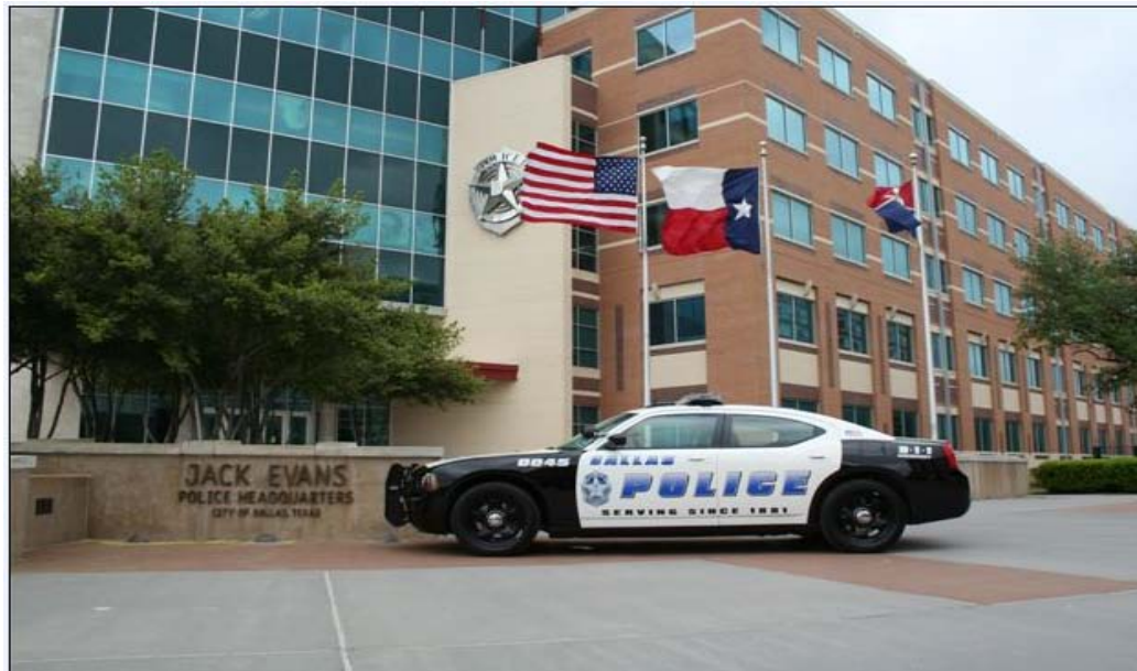
One of the 66 squad cars purchased with JAG funding.