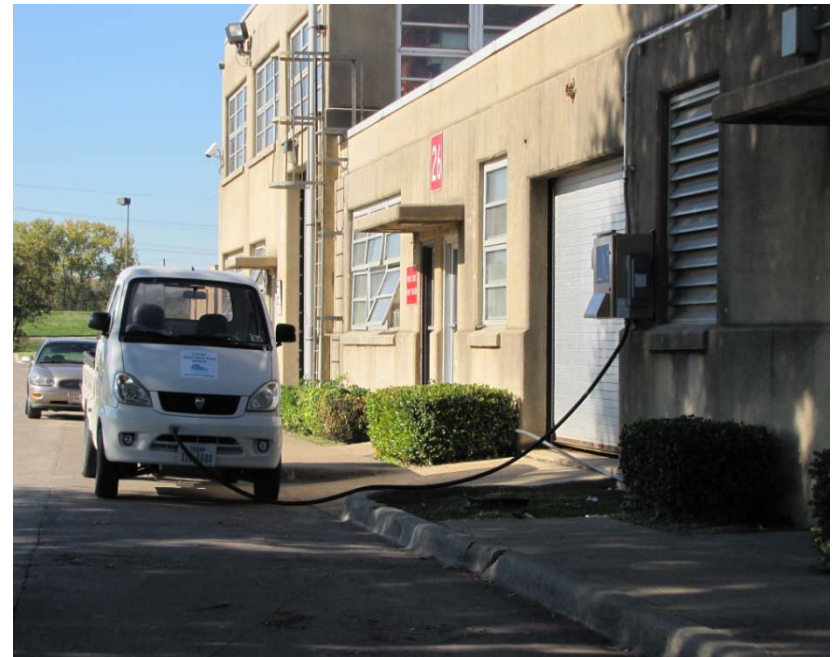
Vehicle purchased with Clean Cities funding using the new charging station.