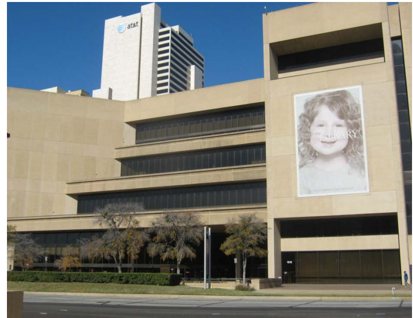
The main Dallas Public Library received LED lighting and controls as a result of EECBG.