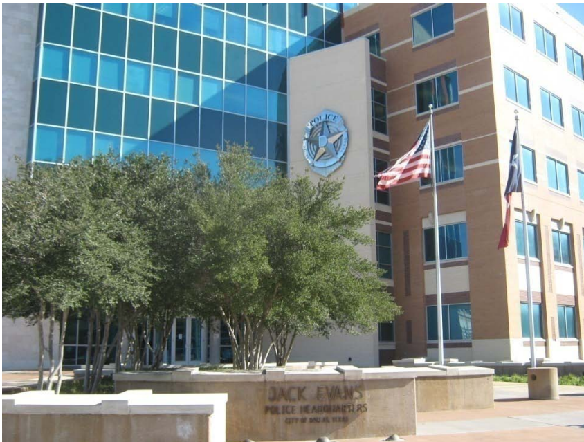
Jack Evans Police Headquarters received LED lighting as a result EECBG.