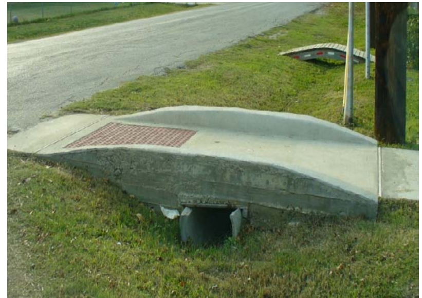
CDBG-R funded sidewalk and curb improvements along Rosewood Avenue (left) and Cheyenne Road (right).