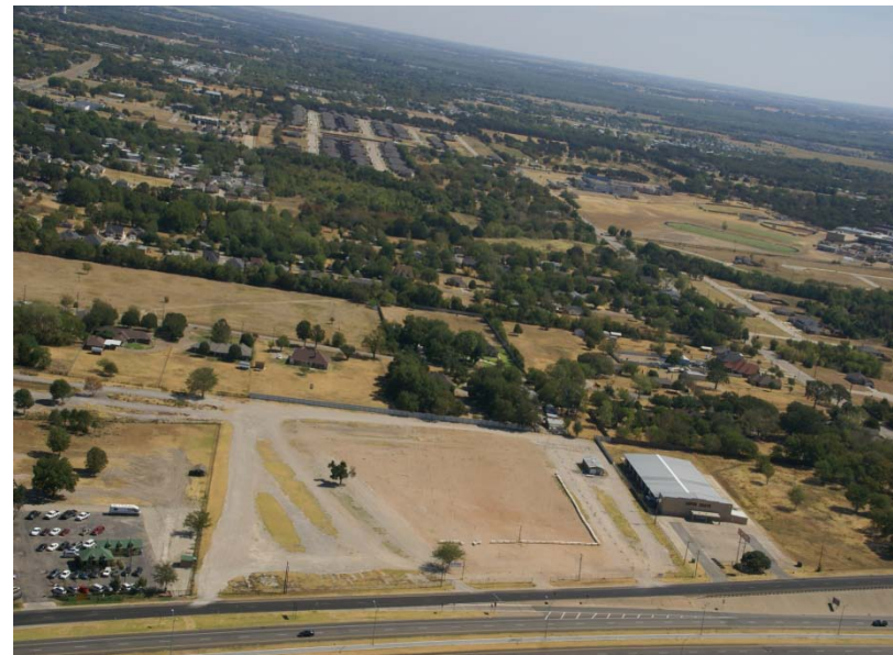
Before and after pictures of a junked car site cleared by Community Prosecution.