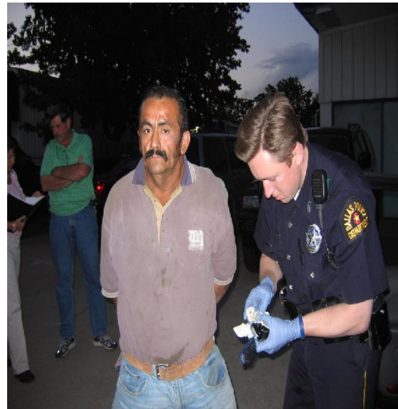
Arrest of Sex Offender by SOAP detectives and patrol officers