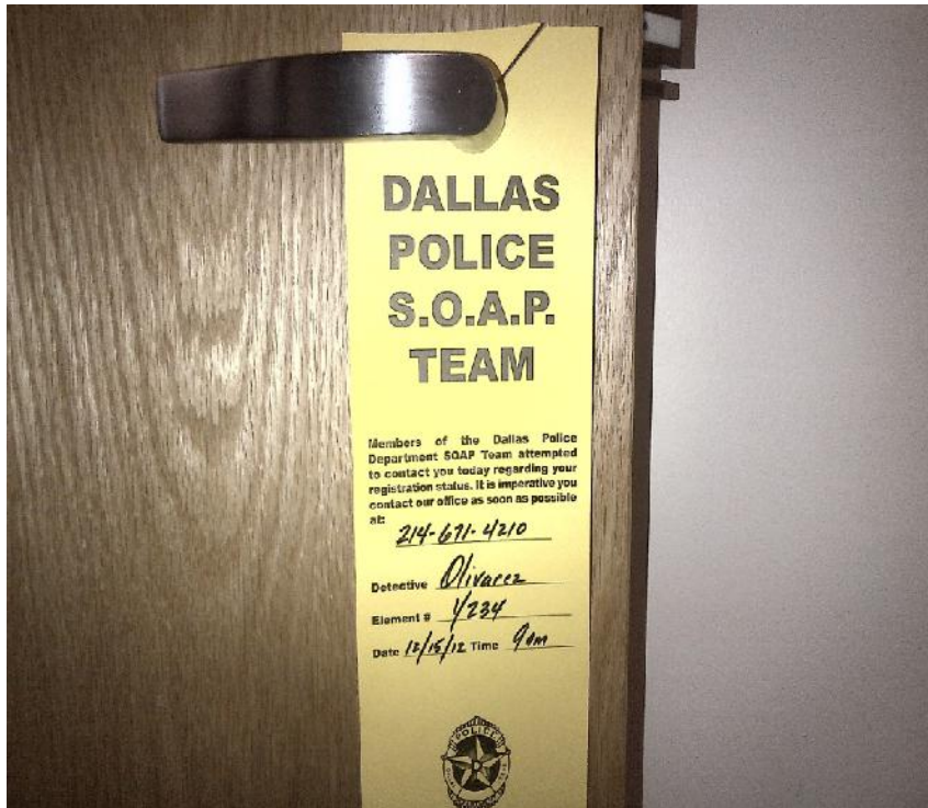
New English door hangers