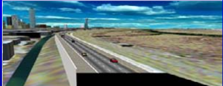
5 - Split Parkway Landside