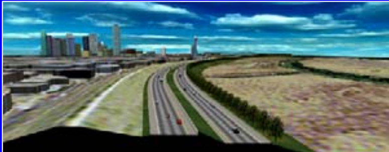
3A - Combined Pky. Original