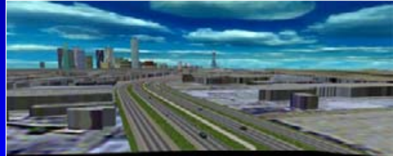
2B - Industrial At-Grade