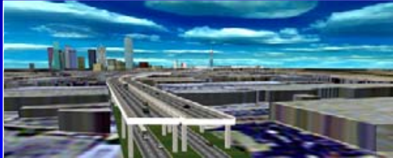
2A - Industrial Elevated