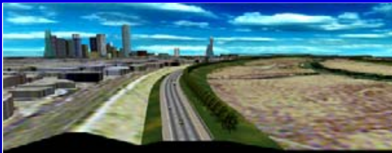
4/B - Split Parkway Riverside