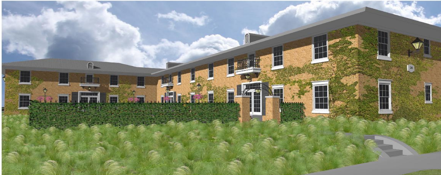
PERSPECTIVE FROM COLORADO BLVD.