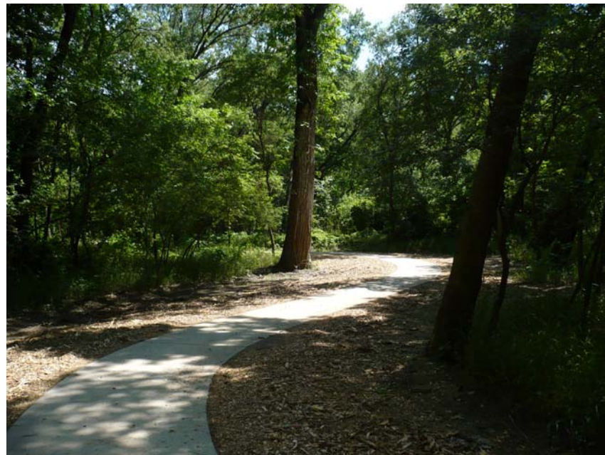
ADA accessible trail alignment avoids large trees