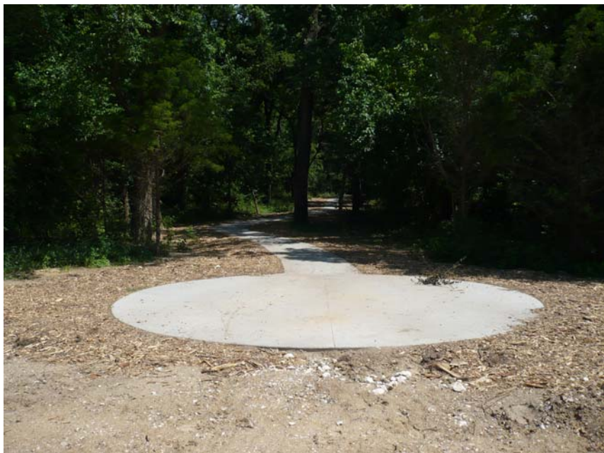
Entry into Great Trinity Forest