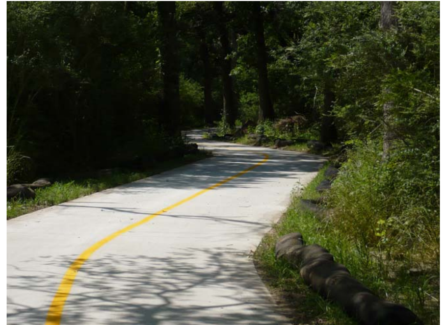
Winding trails add variety to the hiking experience