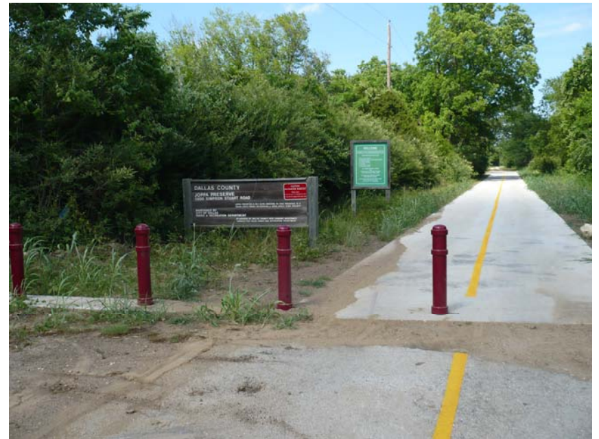
Entry to Joppa Nature Preserve