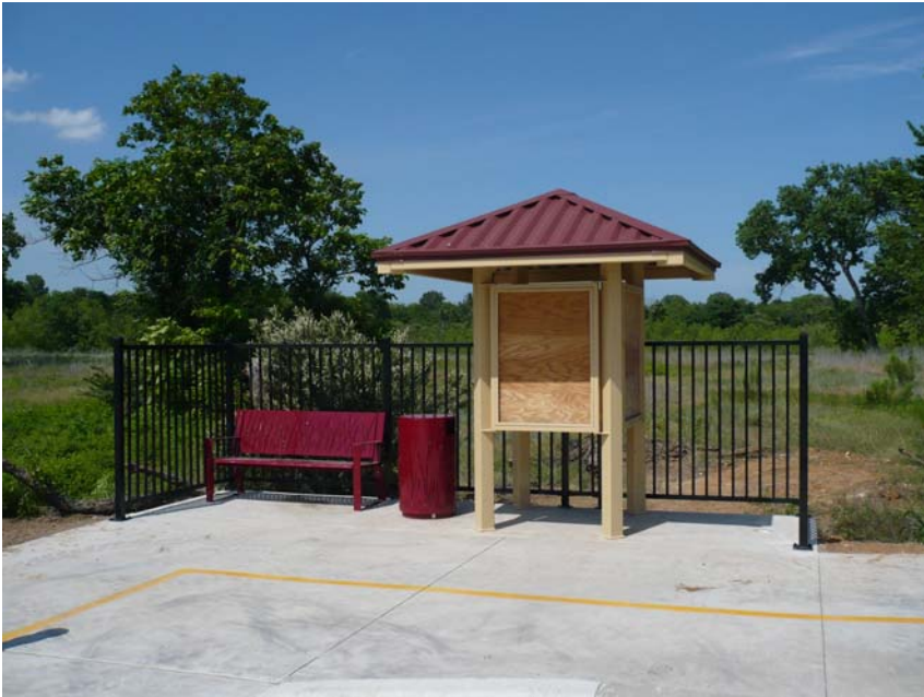
Kiosk, bench and waste can at EcoPark trailhead