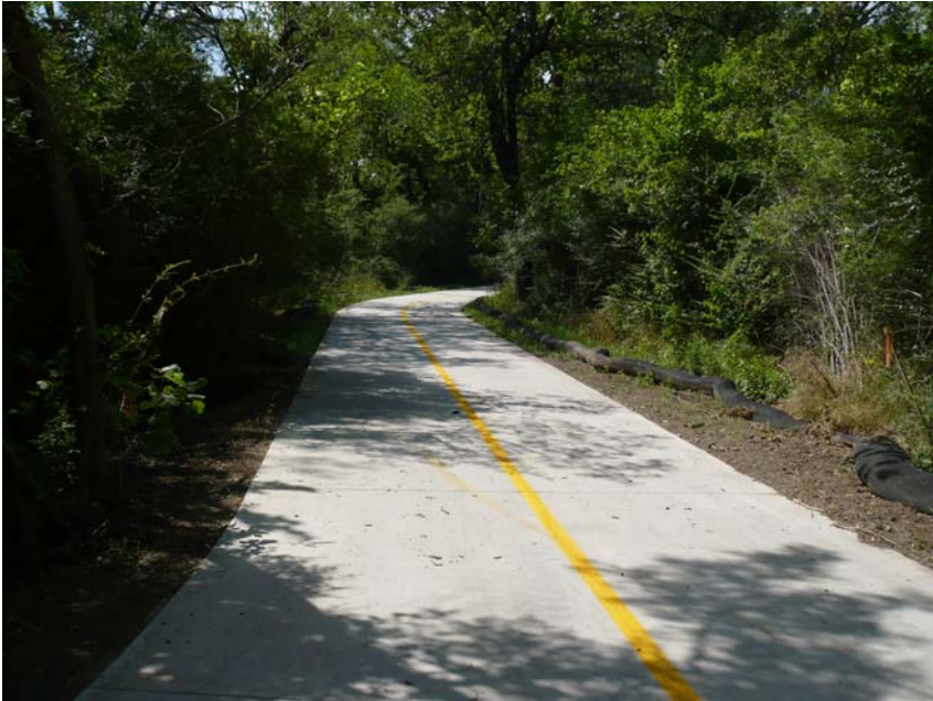
Shaded 14 ft. wide hard surface trail