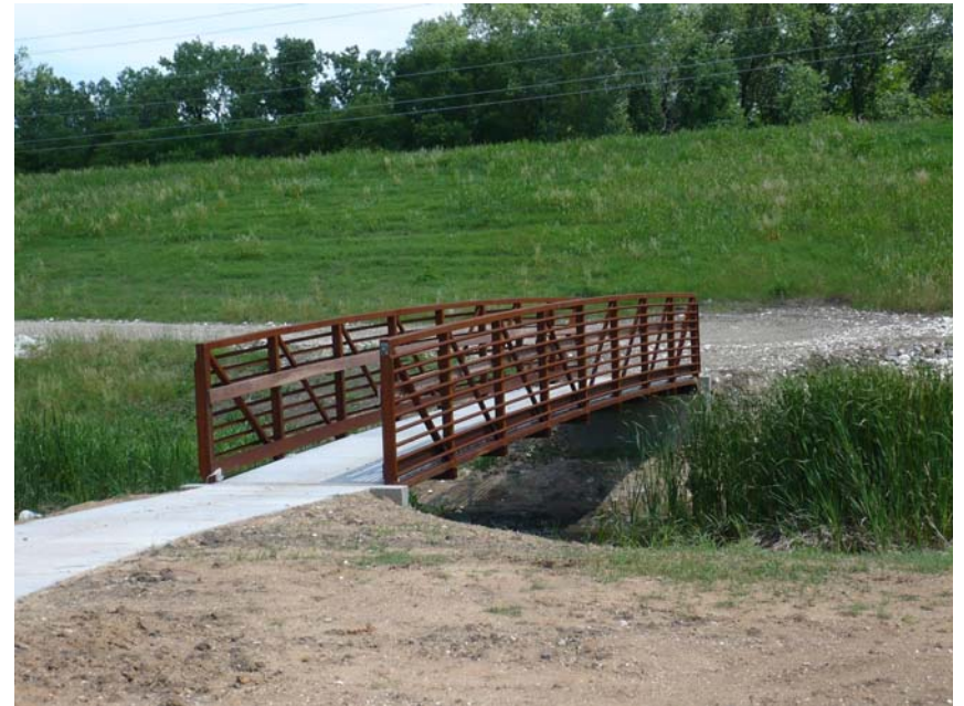
New pedestrian bridge over swale