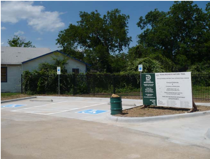
Handicap Parking Spaces