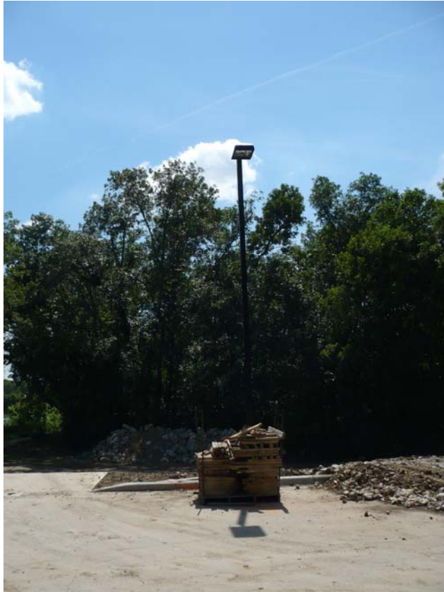
Lighting in Little Lemmon Lake Parking Area