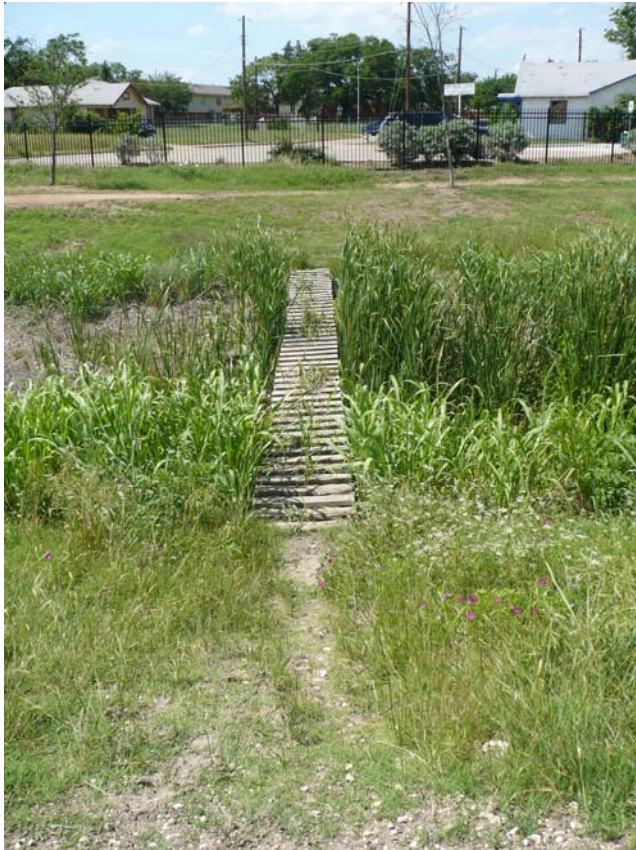
Previous crossing of swale