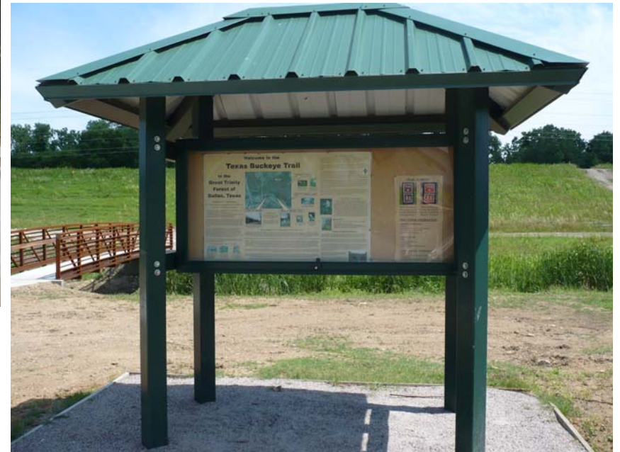
Kiosk at Trailhead, end of Bexar Street