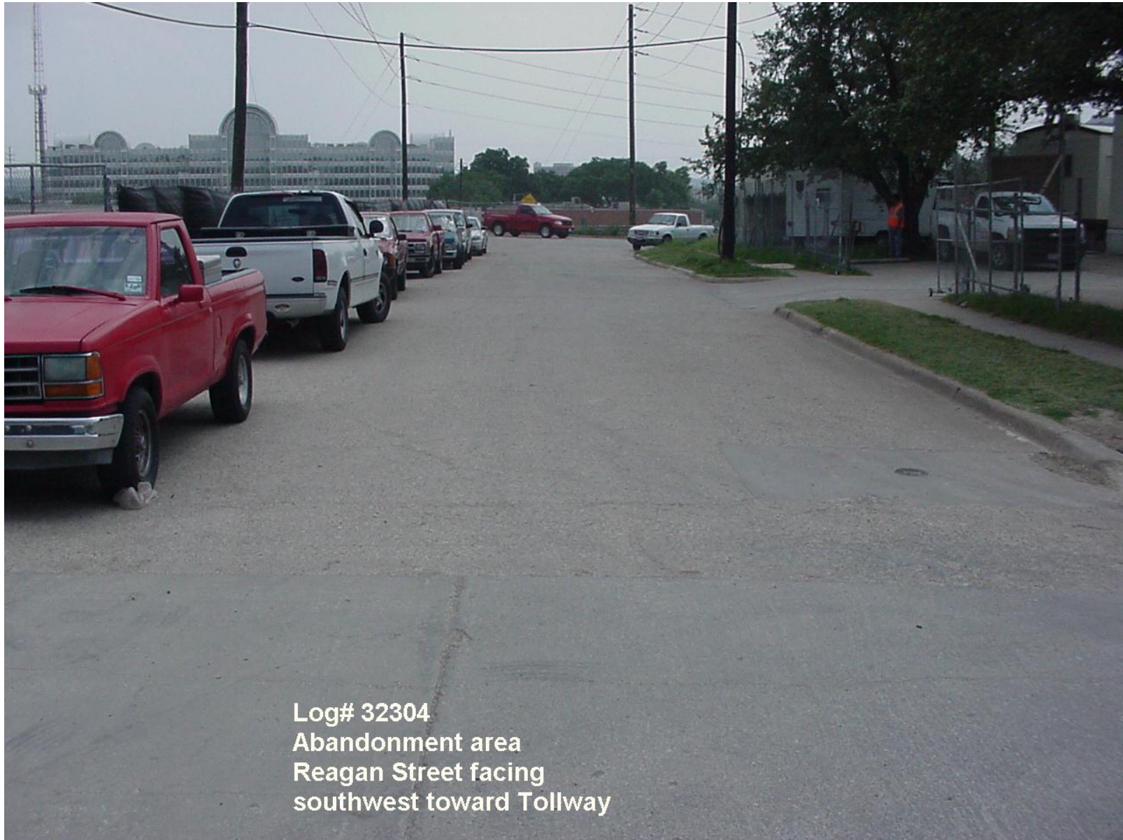
Log# 32304 Abandonment area Reagan Street facing southwest toward Tollway