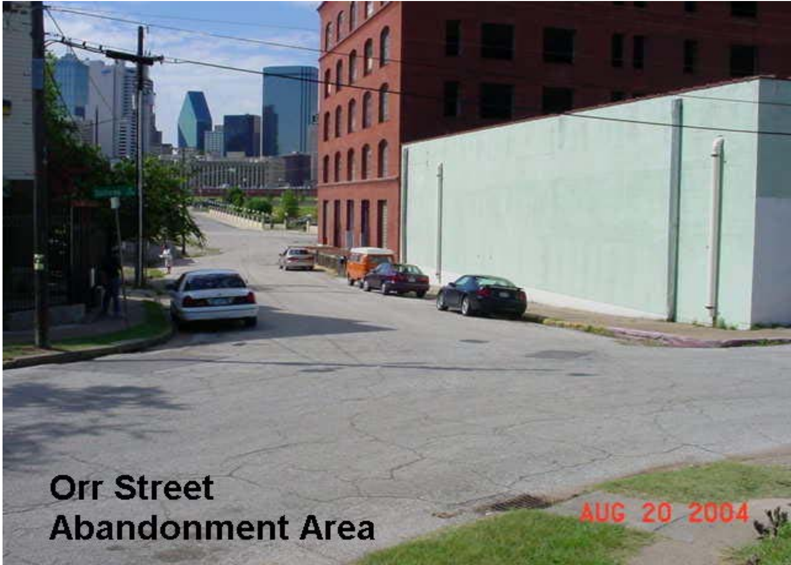
Orr Street Abandonment Area