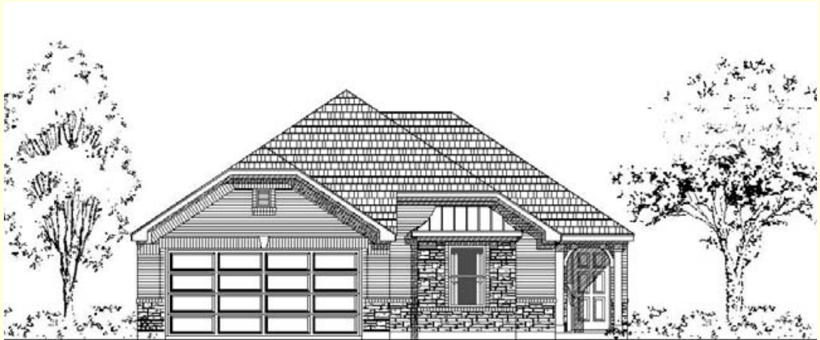
FRONT ELEVATION 'R'