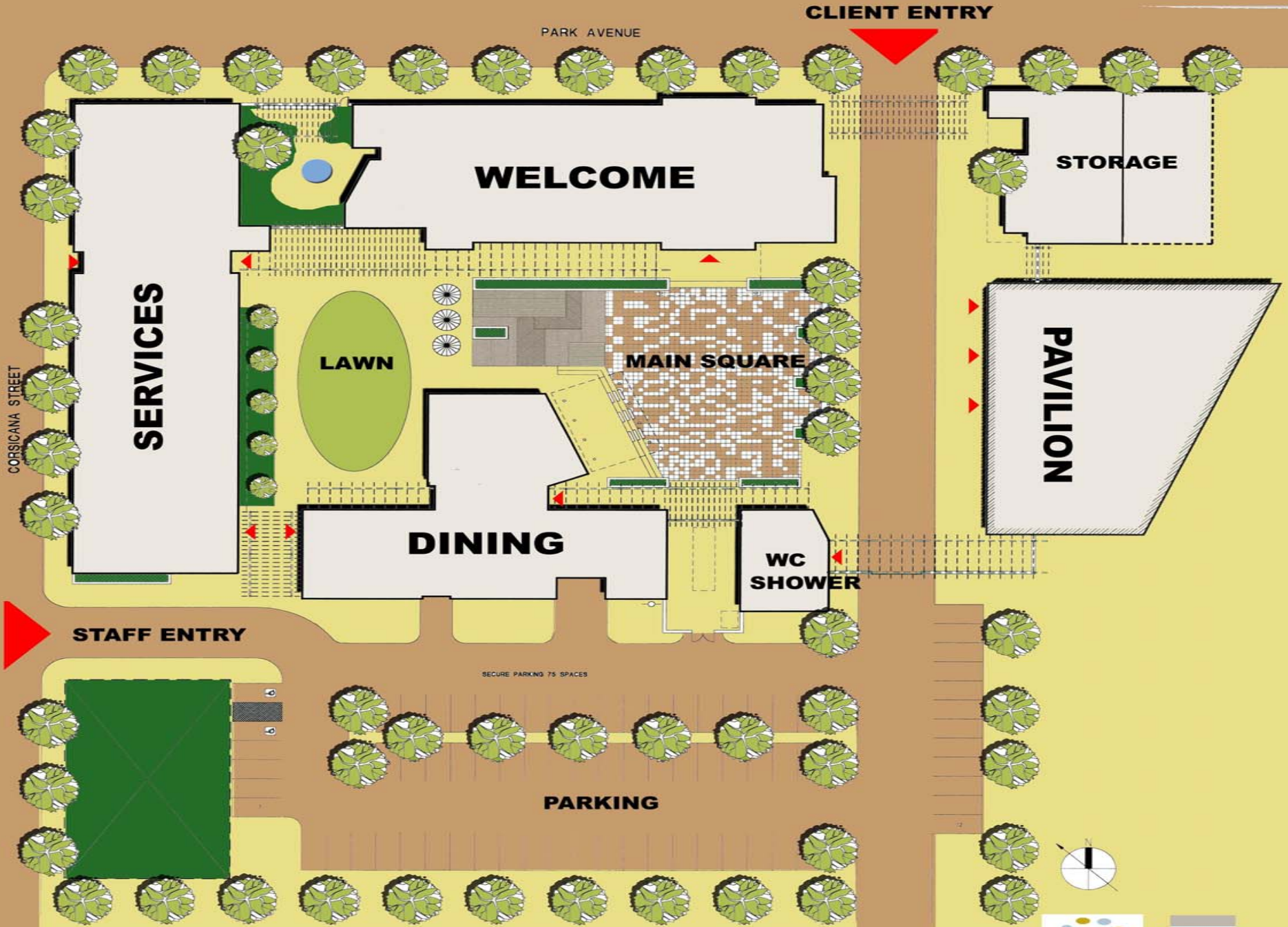
1 SITE PLAN 1/2" = 1'-0"