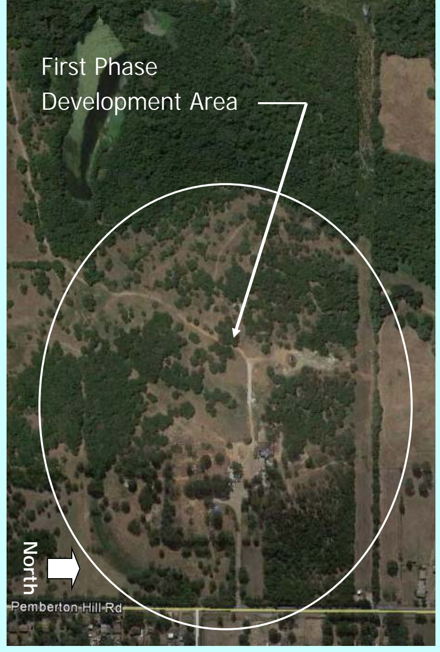
City of Dallas Trinity Watershed Management Department, Trinity River Corridor Project Office