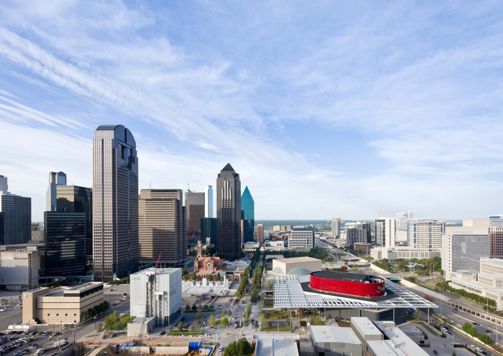
Aerial view of the Dallas Arts District showing the AT&T Performing Arts Center's Dee and Charles Wyly Theatre (left) and Margot and Bill Winspear Opera House (right).