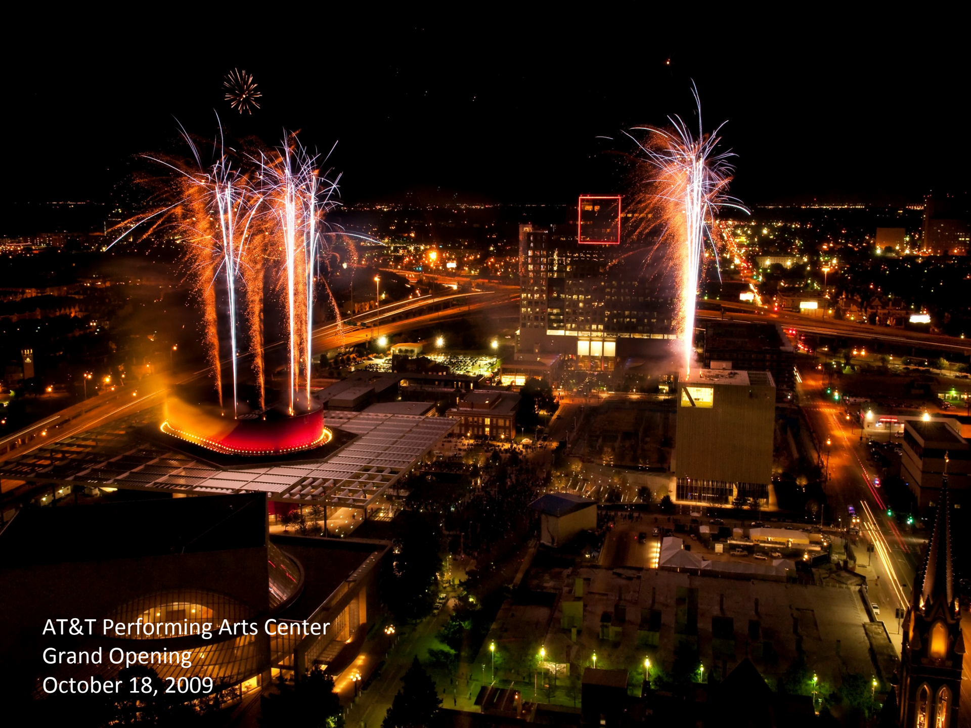
AT&T Performing Arts Center Grand Opening October 18, 2009