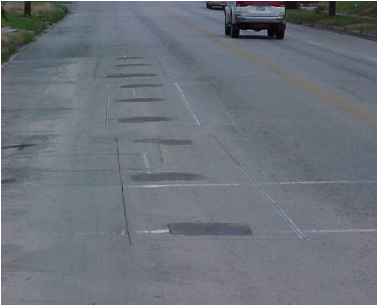
Allowed Before Ordinance

Permanent Repair on asphalt surface that was constructed, reconstructed, or resurfaced more than sixty (60) months prior to repair (Case 3)