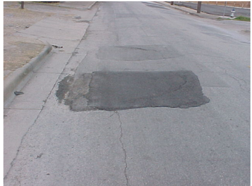
Temporary Repair to Asphalt Street