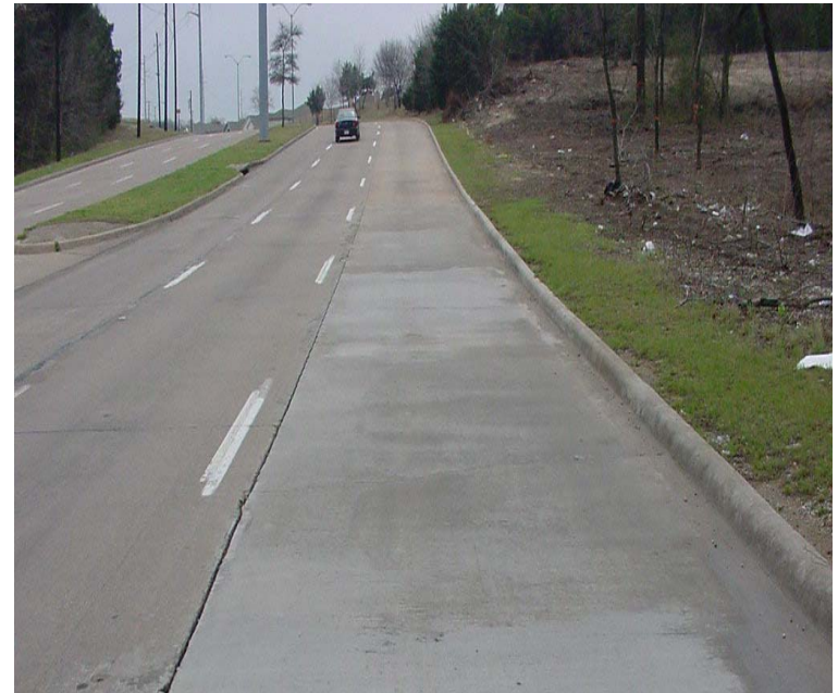
Required by Ordinance