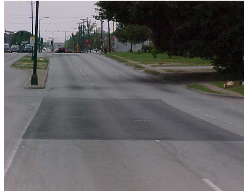
Required by Ordinance