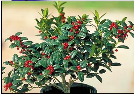
Dwarf Burford Holly