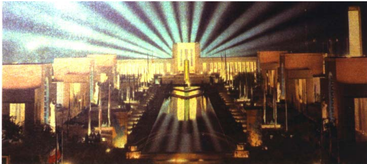
The Esplanade at Night, 1936; The Magazine of Light