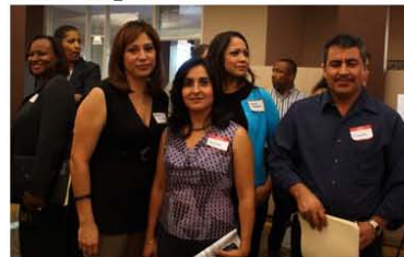
EXHIBIT E – Page 6

MSW has met with many M/WBE firms to discuss their company’s services and capacity. We are keeping a list of all interested M/WBE firms to contact for future opportunities and to communicate project information. We have met with many M/WBE firms to assist with the process of becoming M/WBE certified.