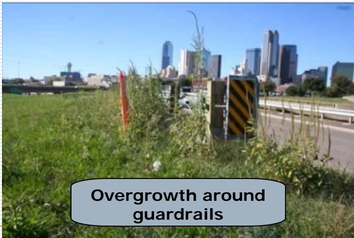
Overgrowth around guardrails