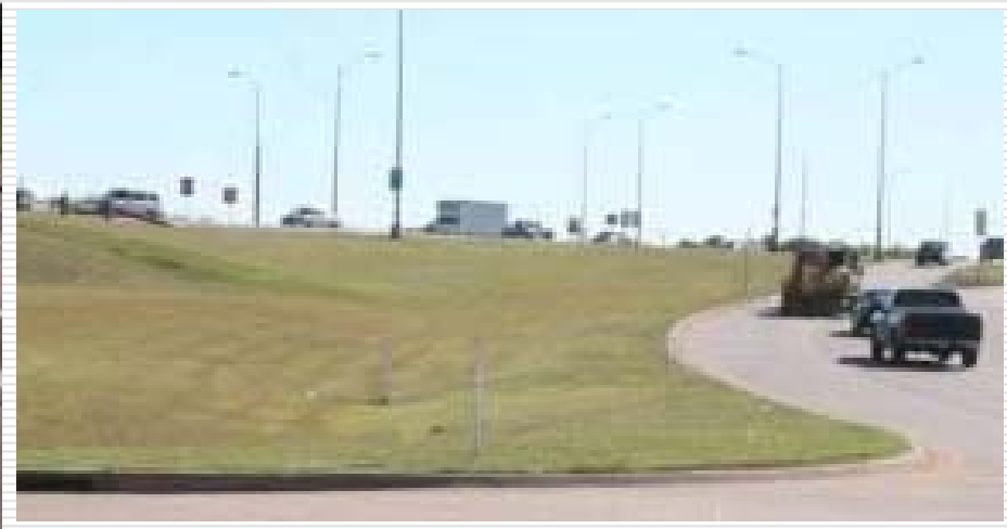
Loop 12 – Buckner @ I-30