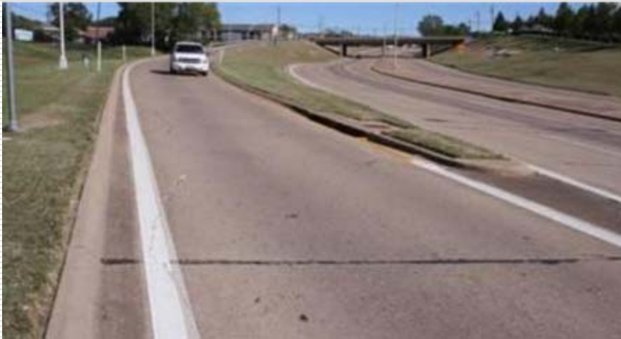
SH352-Scyene Rd @ Buckner

Example of maintenance standard for 300 acres of ROWs previously maintained by City under current MMA