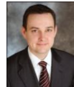
Scott Griggs Council District 3