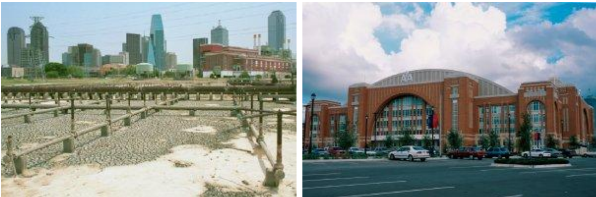
American Airlines Center: A successful Brownfield redevelopment

The City of Dallas enjoys a strong national reputation for its innovative projects that have redeveloped several formerly abandoned sites. The Small Business Liability Relief & Brownfields Revitalization Act and the Brownfields Tax Incentive put property in the City of Dallas on a more level playing field with raw undeveloped properties in the suburbs, encouraging economic development and neighborhood revitalization. Adequate federal support for brownfields redevelopment is crucial to the City's economic development efforts.