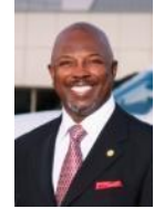
Tennell Atkins Deputy Mayor Pro Tem Council District 8