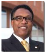
Dwaine Caraway Council District 4