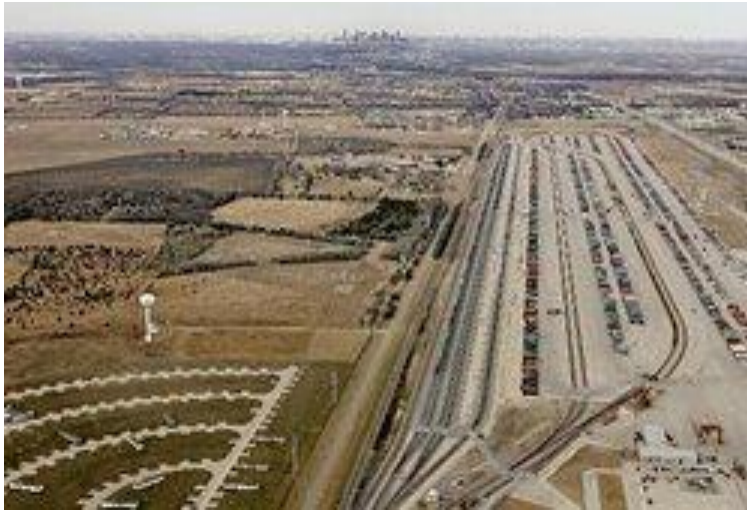
Inland Port of Dallas

The IIPOD will spur economic development in Southern Dallas, provide jobs to a part of the metropolitan area facing chronic unemployment and underemployment, and help address port, highway and rail congestion. Federal assistance and federal programs that recognize the importance of inland ports will help the City of Dallas and its partners realize the full potential of the IIPOD.