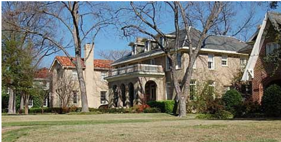
Swiss Avenue Historical District

The Historic Preservation Tax Credit and the Historic Preservation Fund provide valuable assistance to Dallas historic preservation efforts.