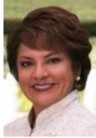
Pauline Medrano Mayor Pro Tem Council District 2