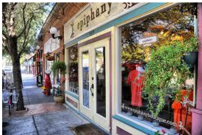
Bishop Arts District

Remote sales lead to significant revenue losses and create an unfair tax structure that hurts local retailers. This is especially problematic for cities such as Dallas that depend heavily on sales tax revenue. The growth of Internet commerce, coupled with recent declines in sales tax revenues, has exacerbated the problem over the past decade.